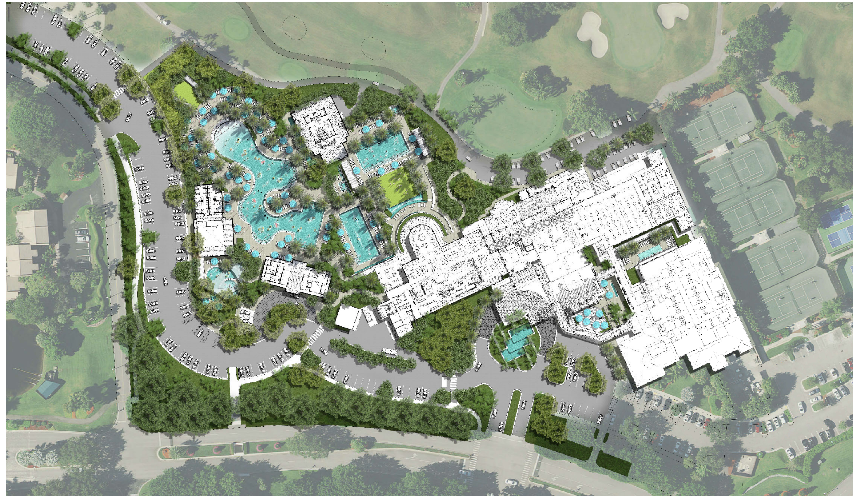
ILLUSTRATIVE SITE PLAN